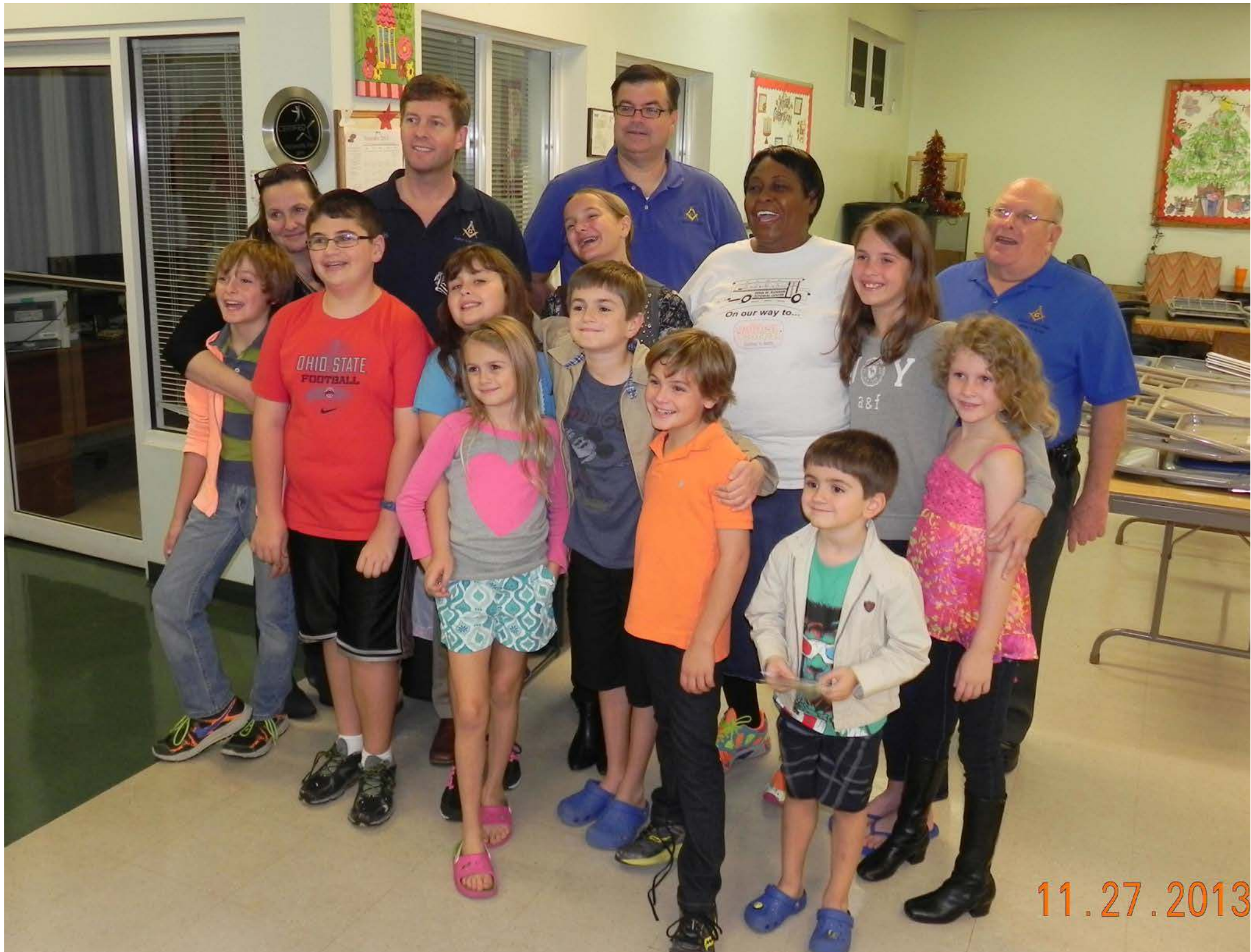
The Jupiter Light Lodge "extended family" enjoying the meaning of Thanksgiving at the meal give away!