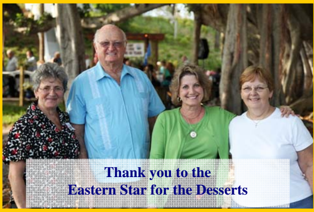
Thank you to the Eastern Star for the Desserts