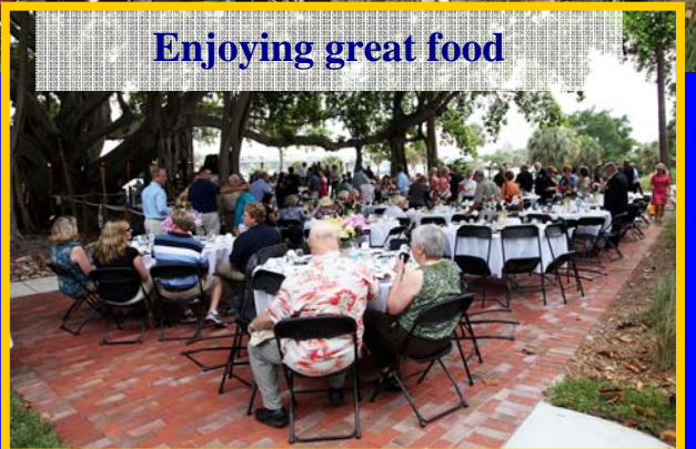
Enjoying great food